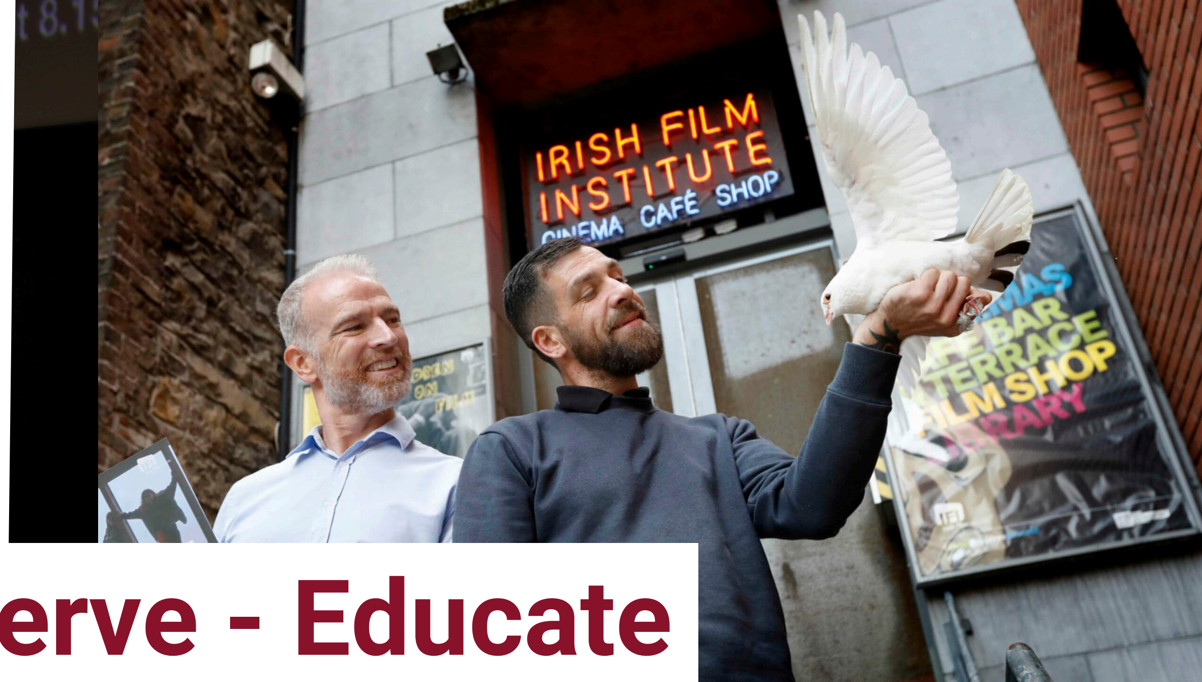
Exhibit - Preserve - Educate

As a charity, all of the income that we generate from private hires goes towards our not-for-profit non-commercial activities including our Education programmes and preserving the IFI Irish Film Archive. By choosing to host your event with us, you are supporting the safeguarding of Irish cinema for future generations to come.