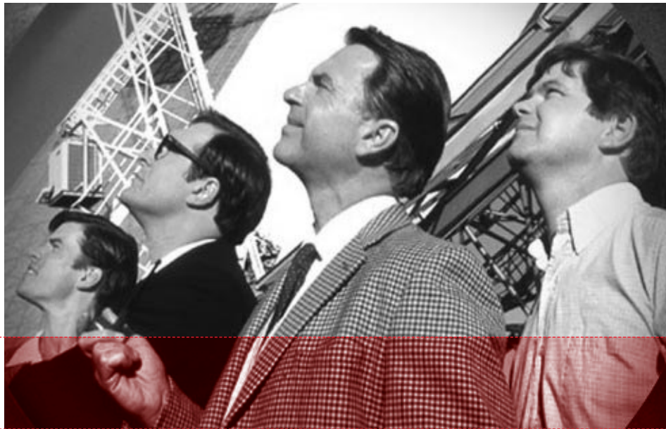
The Dish , Australia's biggest ever box office success

Peter Weir is an important figure in the Australian film renaissance. His haunting and atmospheric Picnic at Hanging Rock (1975) was a success both in Australia and internationally. Adapted from the novel by Joan Lindsay, the film is set in 1900 on Valentine's Day, when a group of schoolgirls on a picnic at Hanging Rock in Victoria disappear without trace.