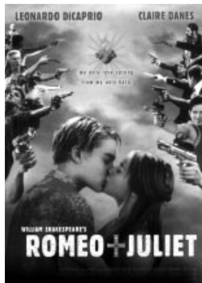
Romeo & Juliet (1996)

Shakespearean language, and Moulin Rouge is a musical. Once the audience accepts that they are always watching a movie and are not seduced into believing that it is real, Luhrmann believes that they will be able to participate actively in the viewing experience.