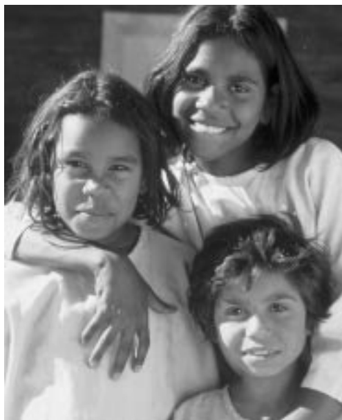
Rabbit Proof Fence Release Date Ireland: 8/11/02