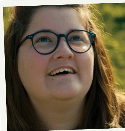
Stars by the Pound