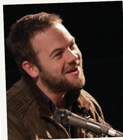
Actor Moe Dunford at Careers in Screen Day 2018