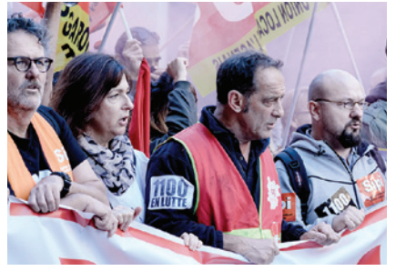
Saturday 17th – 15.30 Monday 19th – 20.20 Director: Stéphane Brizé 113 mins • France • 2018 • Subtitled • Digital Official Competition Selection, Cannes Film Festival 2018

Winner Best Actor, Berlin International Film Festival 2018