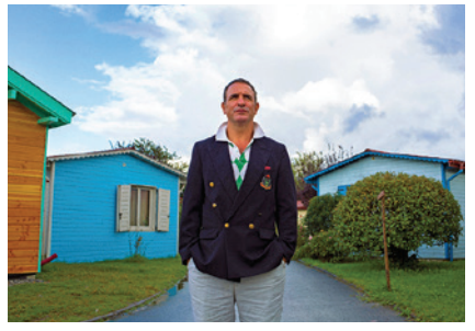
Saturday 24th – 20.30 Directors: Benoît Delépine, Gustave Kervern 103 mins • France • 2018 • Subtitled • Digital Locarno International Film Festival 2018; BFI London Film Festival 2018